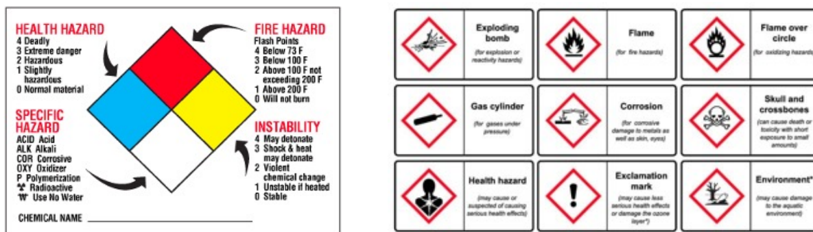
Figure 1- (Left) NFPA Label, and (right) GHS label.

The next topic is Process Gases. Today, most fab processing is performed with Gases rather than chemicals. This includes Gases for thermal oxidation, chemical vapor deposition, and dry etching. There are two main categories of Gases: Bulk Gases and Specialty Gases. Bulk gases include Gases like nitrogen, oxygen, hydrogen and argon. These are produced on-site or at a nearby Gas plant, like we show in the image on the left side of Figure 2. They are piped directly to the process tools. Specialty Gases are delivered to gas cabinets in pressure vessels, or gas bottles, like we show in the image on the right side of Figure 2. Most etch gases are