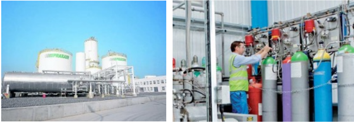
Figure 2- (Left) Gas plant, and (right) Specialty Gases.

delivered this way. The contaminants of concern include particles, metallics, and water. The purity level is usually specified as a percentage, for example 99.9999% pure. The piping to the process tools is critical as contaminants can be introduced through poor or improper welding, or contaminated plumbing materials. Some tools may also have point-of-use ultra-filtration, like we mentioned with chemicals.